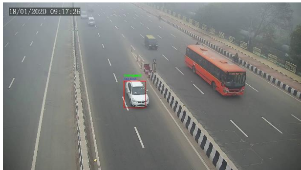
Vehicle Overspeed Detection