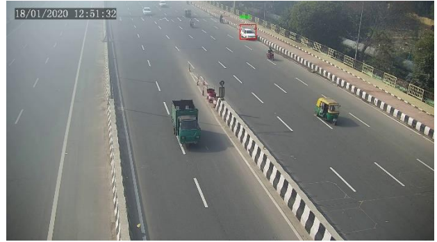
Stop Vehicle Detection