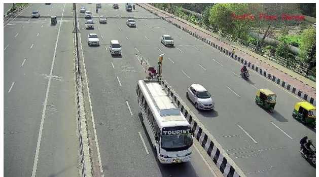
Traffic Flow Detection: Dense