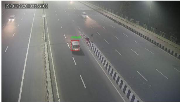
Wrong Direction Detection