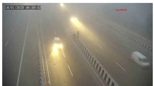
Fog/Low Visibility Detection