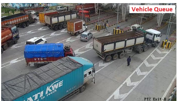
Vehicle Queue Detection