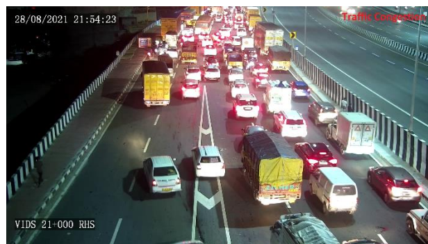
Traffic Flow Detection: Congestion